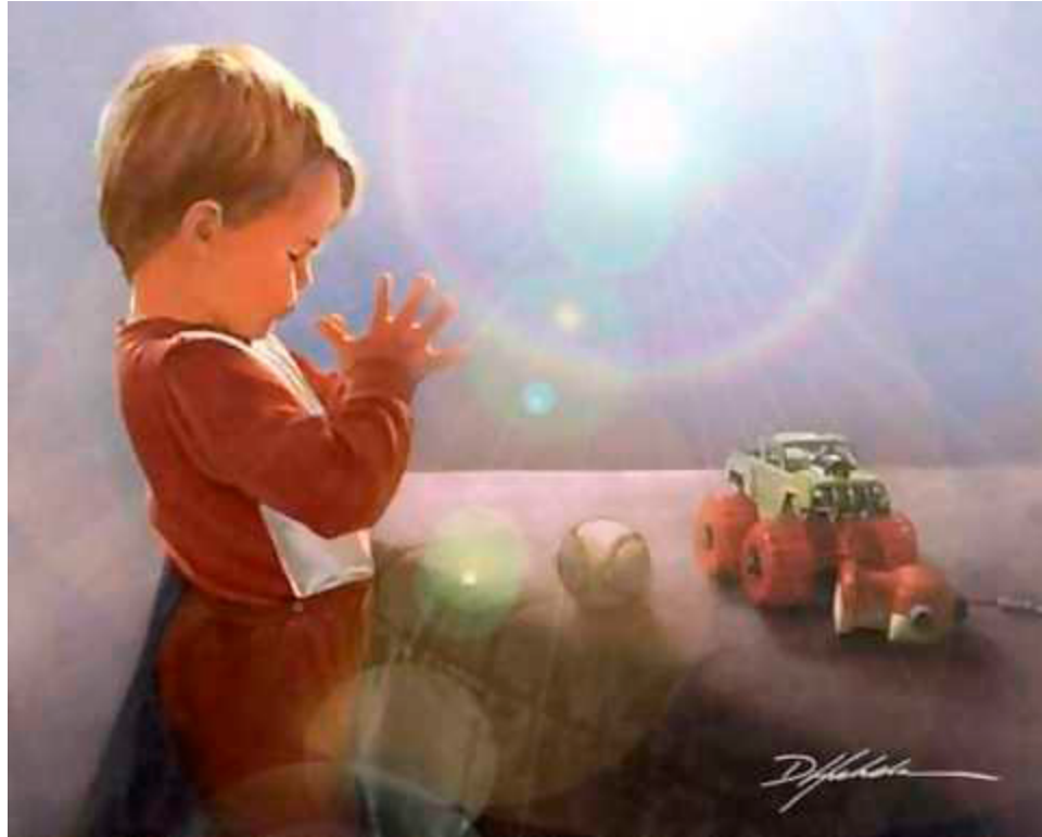
Me (Age 3)