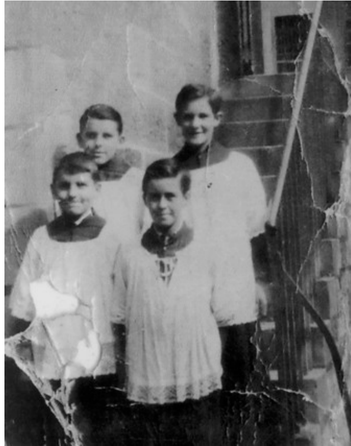
Me and My Friends (Age 11)